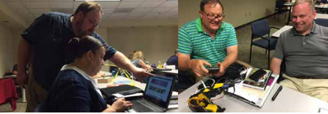
Hands on new tech at the Summer Leadership Institute at SAANYS on July 20.